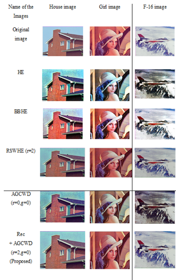
Figure 2: Color test images for comparison on House image, Girl image, F-16 image